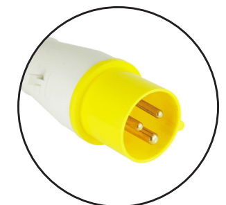
110V CEE PLUG