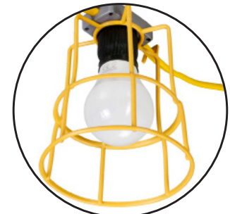
FESTOON GUARDS - PLASTIC